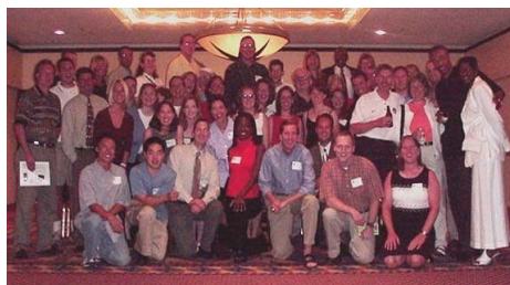
Present and past Spartan alumni join together in celebration during the 2001 NATA Clinical Symposium in Los Angeles.